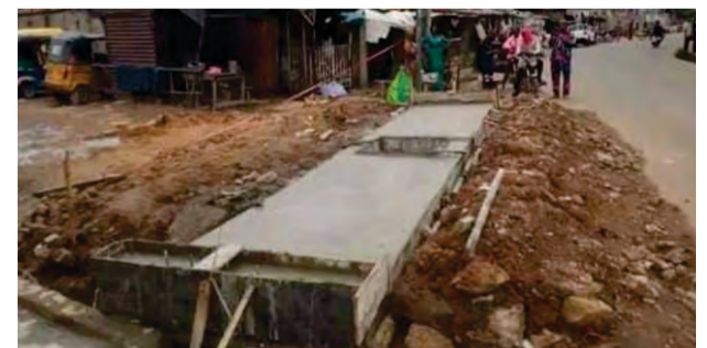
Picture of one of the ongoing culverts construction

residents to cooperate with the government in its efforts to curb the excessive flood.