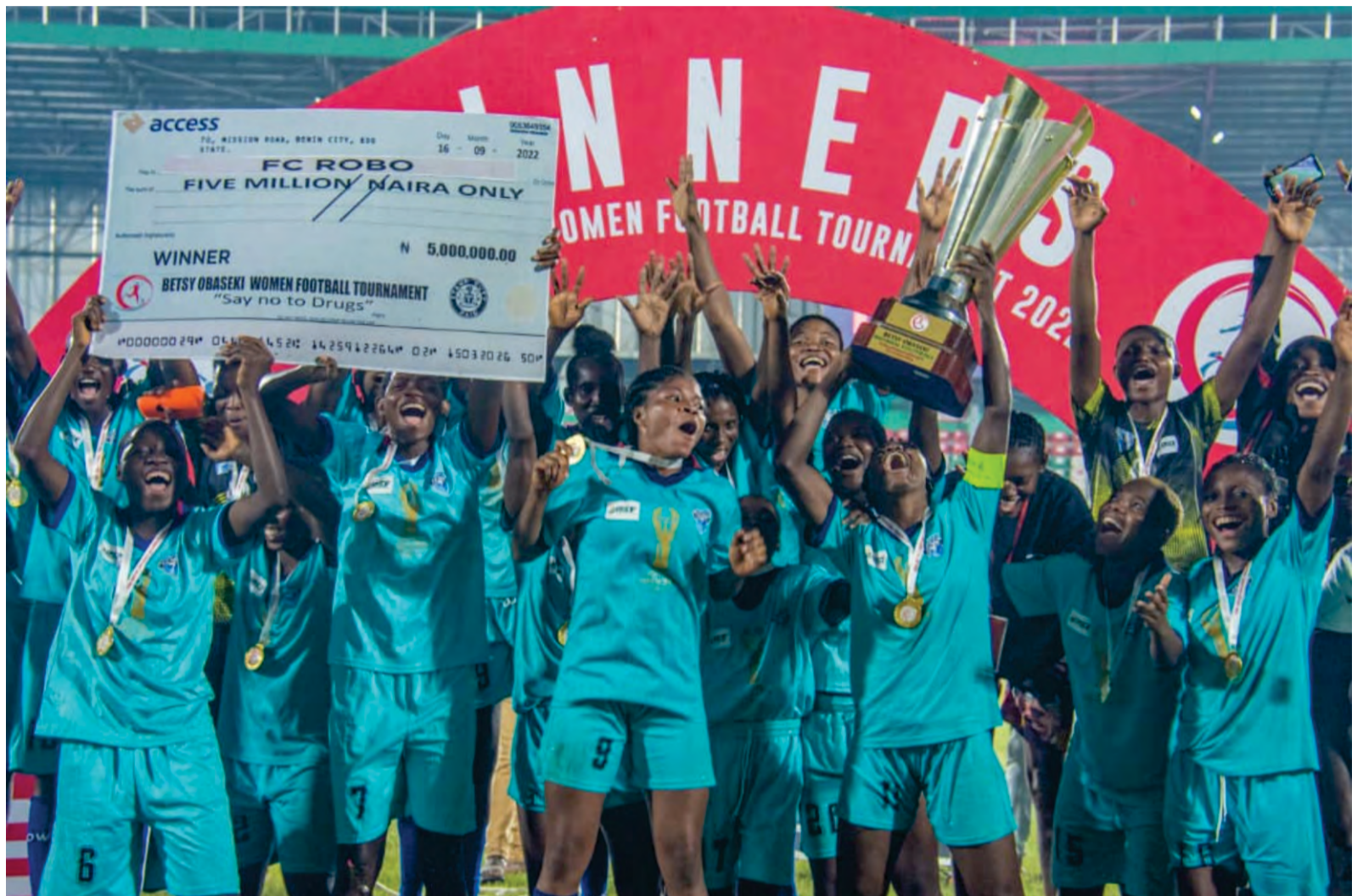
FC Robo Queens emerged champions of the Betsy Obaseki Women Football Tournament