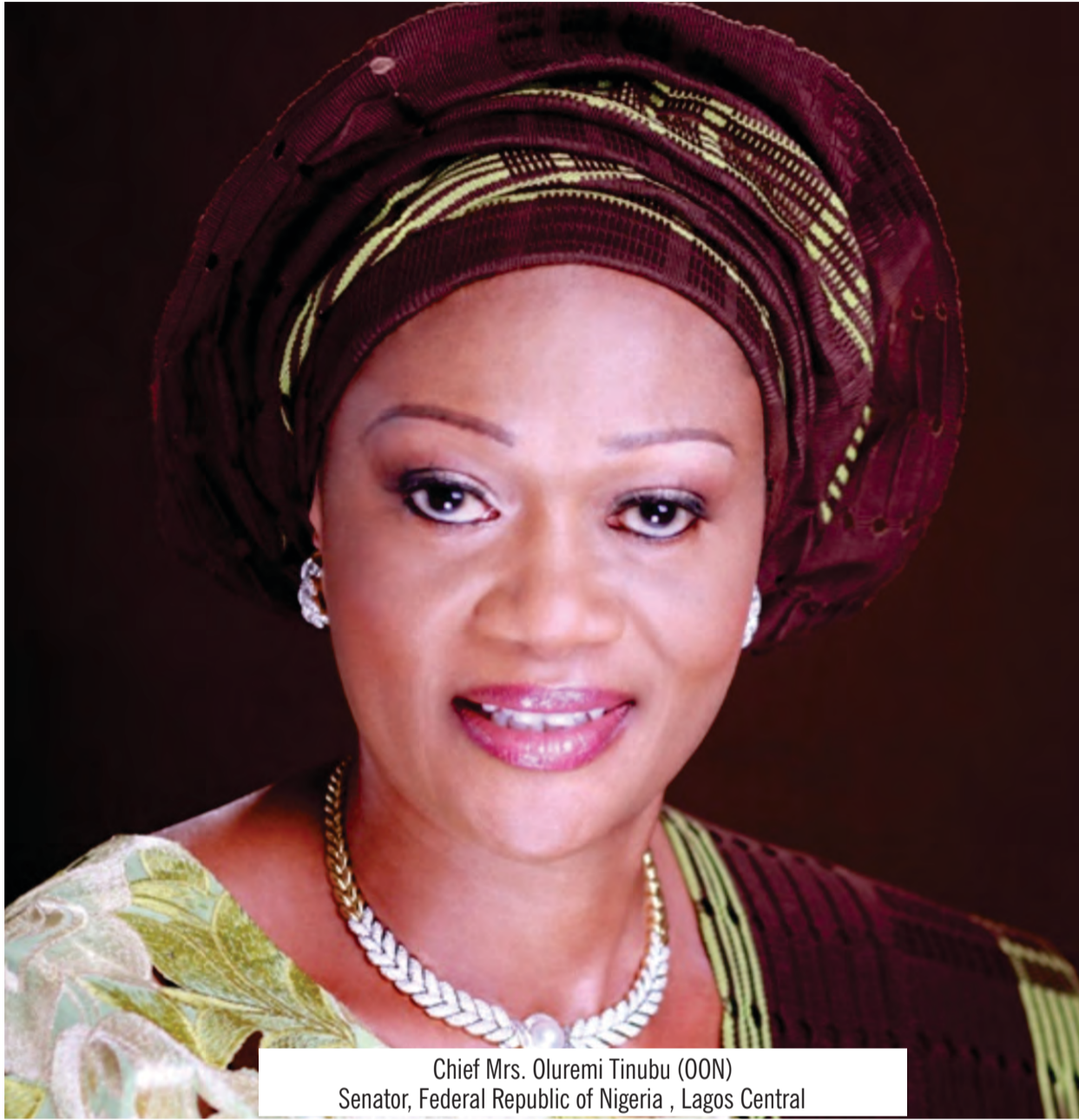
Chief Mrs. Oluremi Tinubu (OON) Senator, Federal Republic of Nigeria , Lagos Central