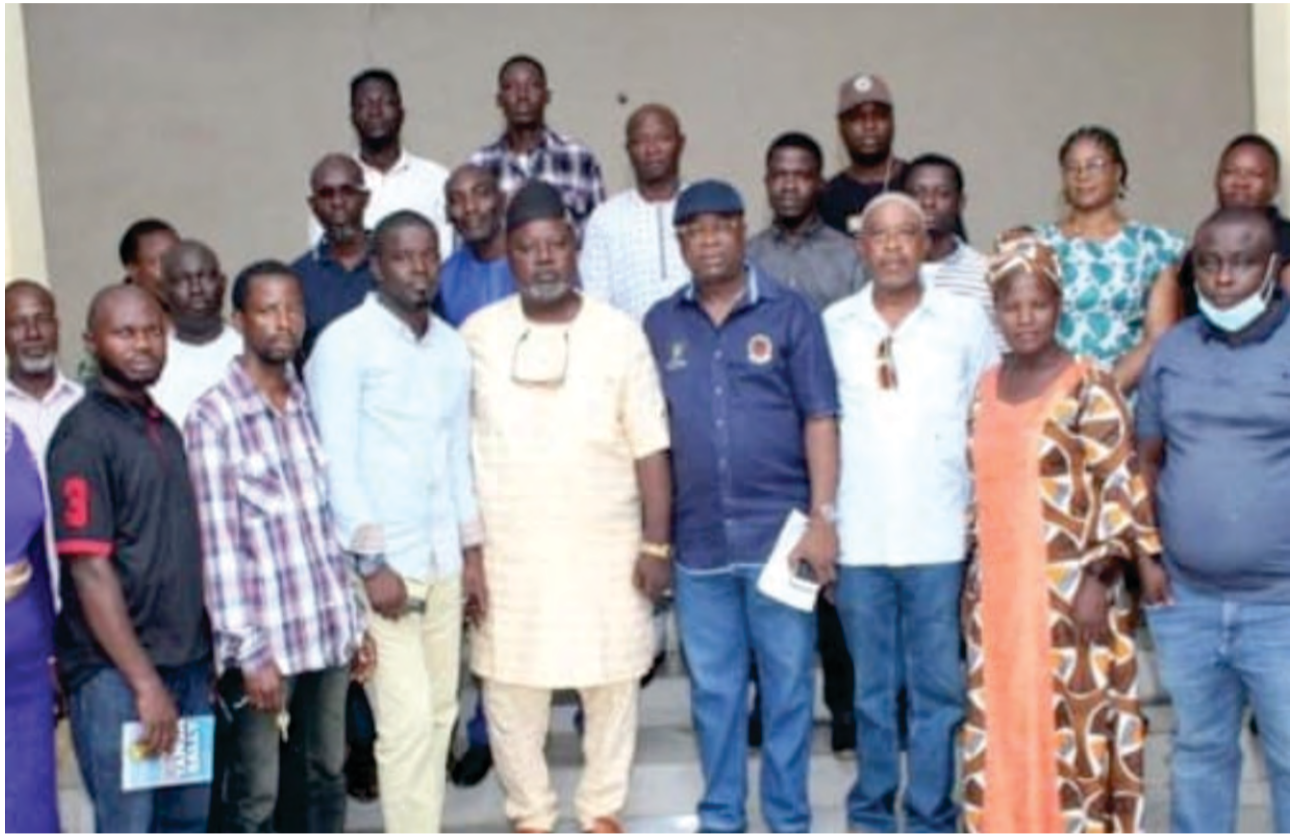
Participants at the Agricultural training

He disclosed that the council has taken care of the participants' training fees and has also provided stipends for the participants throughout the training.